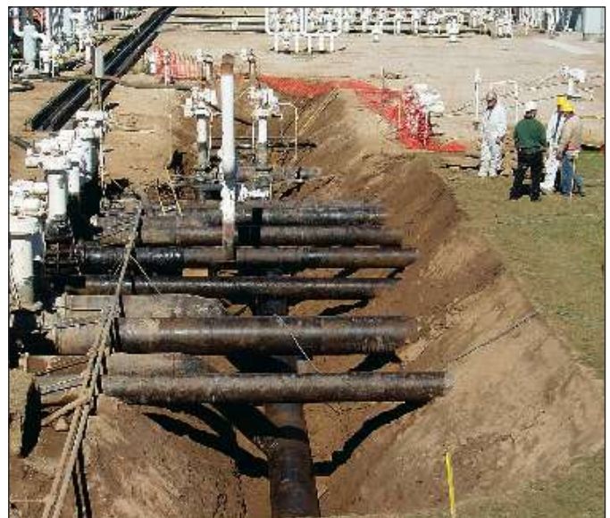
(Left to right) Tom Vilburn, Jim Steiner, Chad Treglowne and Dave McKellar view their recently completed 850-cubic-yard excavation. The hydro-excavation process successfully uncovered and exposed everything underground without disruption or damage.

Doetsch Industrial Services, Inc. has definitely adopted two unique methods of excavation and erosion control that have proven successful. Not only is the hydro-excavation service safer, cleaner and more efficient than conventional digging methods, but it's environmentally conscious, as well. It leads to less material removed and decreased environmental disruption. ♡