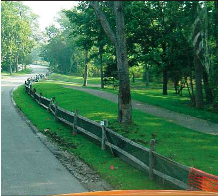
The turf restoration process (pneumatic conveyance) that Doetsch Industrial Services, Inc. used on the Quarton Lake project in Birmingham yielded significant vegetation growth in only a matter of about 15 days after applied.

been used up in Canada for years because the ground is frozen most of the year and it was the only way they could excavate," said Schotthoefer.