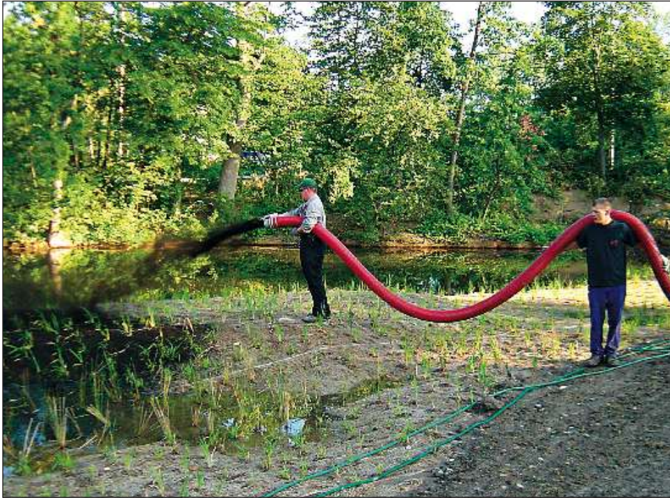
TOP: Mike Mehal (left) and Don Landis (right) apply the compost to a vegetated wetland by pneumatic conveyance at Quarton Lake. The process did not disrupt the existing plants at any point. RIGHT: Doetsch had completed the actual conveyance of the compost at Quarton Lake by the end of July 2003. BOTTOM: Dave Black (left) and Jason Hale (right) gradually uncover and expose a massive underground configuration of pipes and wires by using hydro-excitation.

hand digging, the Doetsch workers did not need to physically crawl into the tight space to dig. They stood on the surface and shot the water down and followed the cut path in a much quicker fashion. The ability of workers to stay above ground while excavating is also a safety feature, helping them to avoid the risk of a trench collapsing down upon them if they are several feet below ground.